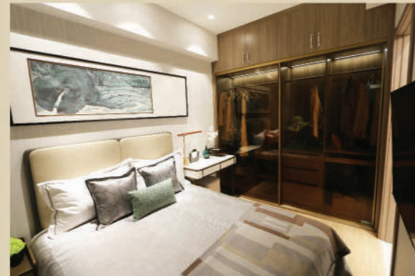
*representation image, fumitures are not included / non decoration standard