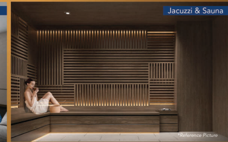
Jacuzzi & Sauna