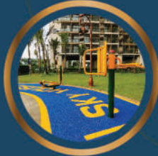
Outdoor Activity Platform