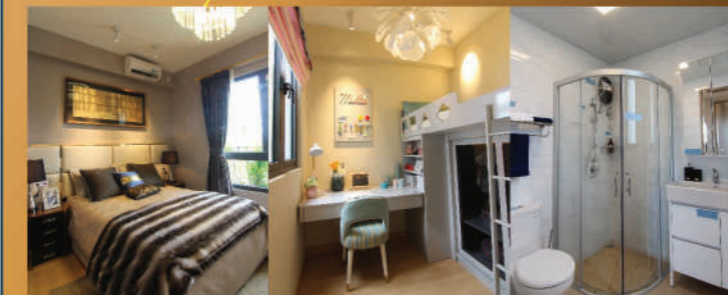
*representation image, fumitures are not included / non decoration standard