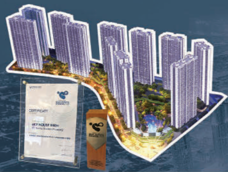
INDONESIA The Best Apartment in South Tangerang > 1 Bio (rumah123.com Real Estate Awards - 2018)

In Indonesia, we are committed to combine Risland's leading design concepts with the needs of local customers and proud to offer one of the modern apartment product lines "Sky House", which has been on the Indonesian market for four years. Sky House BSD+ is the first project of Sky House in Indonesia.