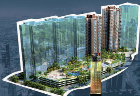
INDIA Iconic International Project of Mumbai (Mid Day Real Estate Icons - 2018)