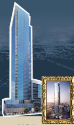
USA Building of The Year (6sqft Building of The Year - 2018)