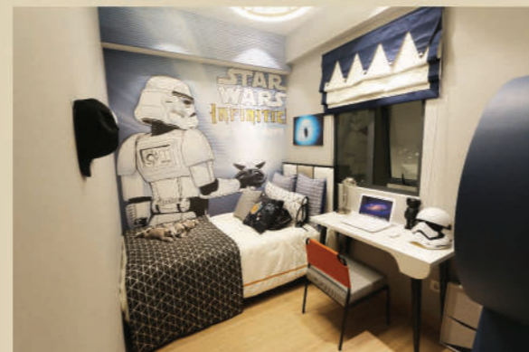
*representation image, fumitures are not included / non decoration standard